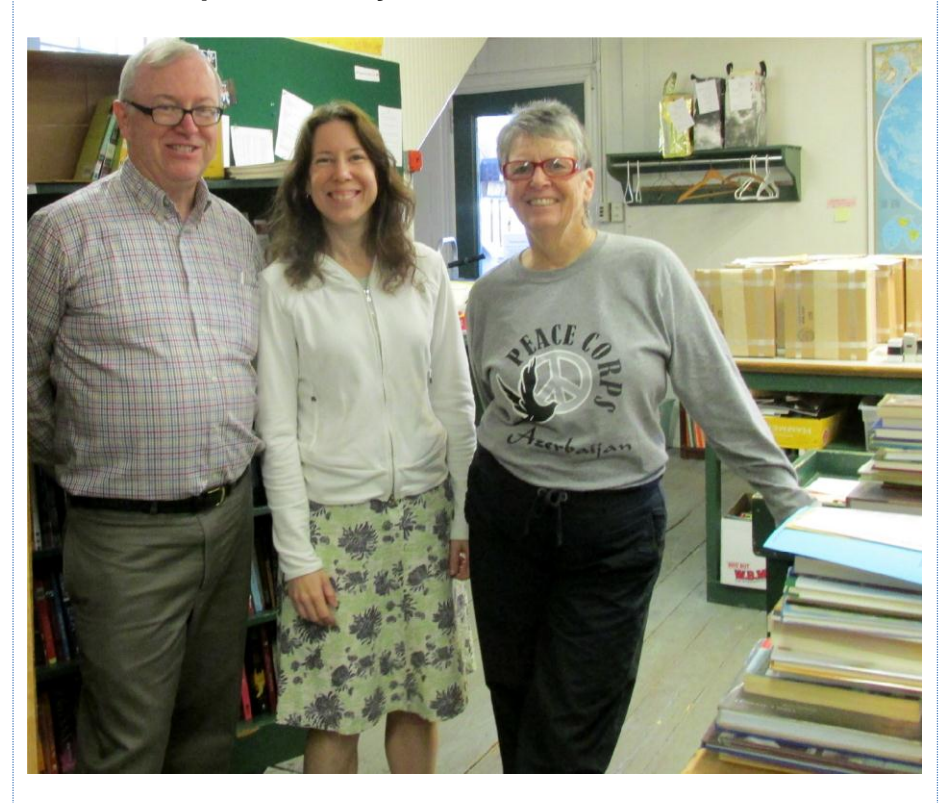
Several Connecticut Returned Peace Corps Volunteers