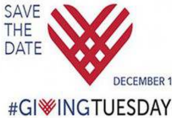
On #GivingTuesday, Help the Peace Corps Let Girls Learn