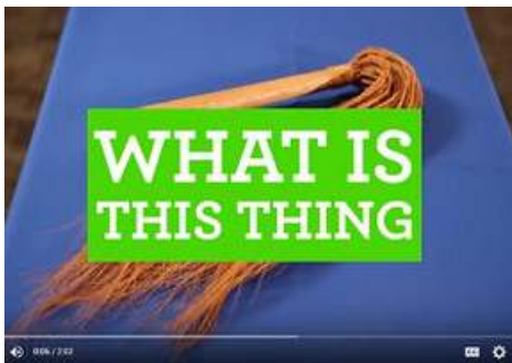
Guess the Purpose of these Unique Objects from Around the World