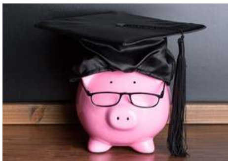
147 Ways to Help Pay for Graduate School