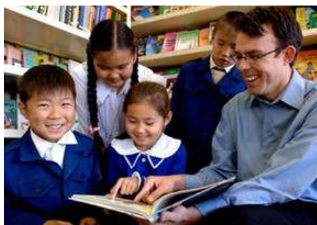
What it's like Living and Working as a Native American in Mongolia