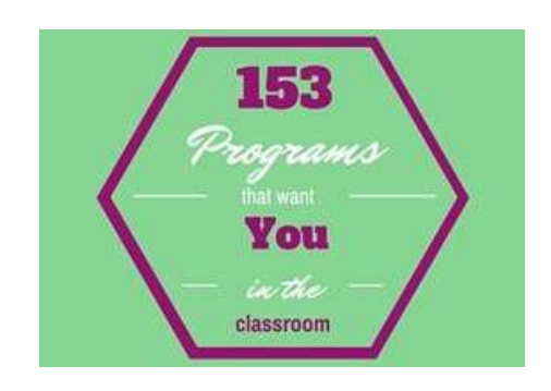
Opportunities for You