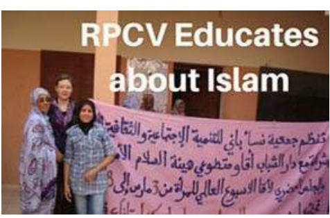
Bridging Cultural Divide