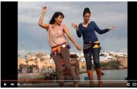
PC Morocco is Happy