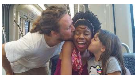
Dating Site That Hooks Up Volunteers Leads to a Valentine's Day Wedding

Triple dawwww! Two Returned Peace Corps Volunteers meet through a dating site created by an RPCV couple that targets people who value volunteering -- and they get married on Valentine's Day!