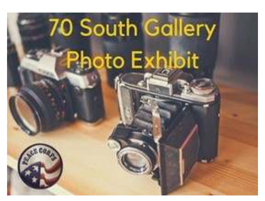
Submit your Photos