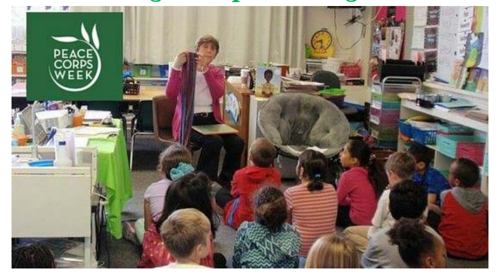
We are happy to announce the winners of the Peace Corps Week Group Challenge. Thank you to everyone who participated.