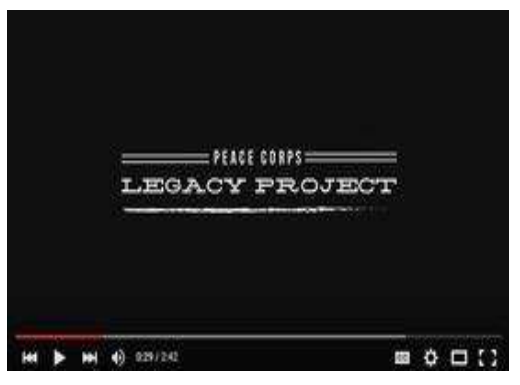
Malawi Education Minister