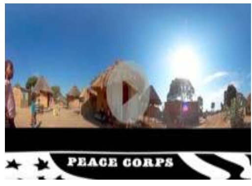
360 view of Zambia