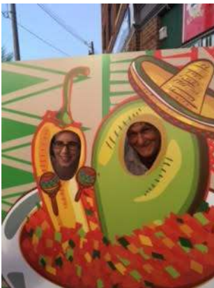
CTRPCVs celebrated Cinco de Mayo at El Paso Restaurant in Plainville

Hi, my name is [FIRST AND LAST NAME] and I'm your constituent in [CITY, STATE]. (I served our country as a Peace Corps Volunteer in [COUNTRY] from [YEARS].) I'm calling today because I'm very concerned about the proposed cuts to the Peace Corps. These cuts would limit the number of opportunities to serve, restrict American influence abroad, and threaten to roll back more than 56 years of global impact. With all of the global challenges facing America today we need a strong and effective Peace Corps to promote sustainable development, democratic ideals, and partnership between nations. I strongly urge the Senator to protect funding for the Peace Corps and ensure the agency is funded at $410 million for fiscal year 2018.